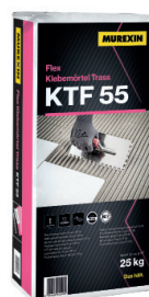
KTF 55 TRASS FLEKSIBILNO LEPILO