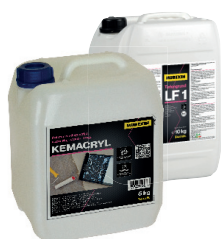
KEMACRYL / LF 1 GLOBINSKI PREDPREMAZ