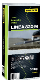
LINEA 820 M