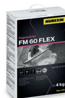
FM 60 FLEX FUGIRNA MASA