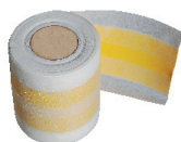
KEMABAND TES. TRAK 12