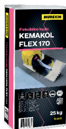
KEMAKOL FLEX 170