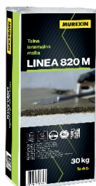
LINEA 820 M