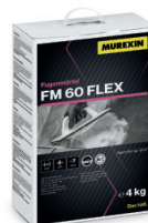
FM 60 FLEX FUGIRNA MASA