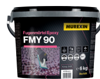
FMY 90 EPOKSI FUGIRNA MASA