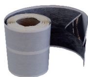
KEMABAND TACK 12