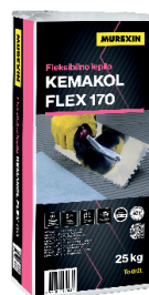
KEMAKOL FLEX 170