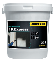
1K EXPRESS BITU. PREMAZ