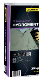
HYDROMENT FINI OMET