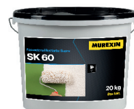
SK 60 SILIKATNA FASADNA BARVA