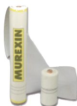
ENERGY TEXTILE MREŽICA